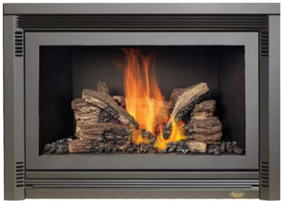
Rosario Face Black Door

A face is required for your Lopi insert, choose from the designs featured below: