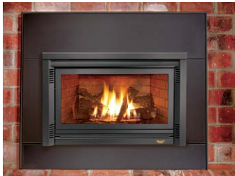
Bottom panel To finish fireplaces that are elevated. This panel will cover up to 177mm below the insert (3 Piece Panel)