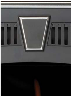
Close-Up Carbon Patina Edge Detail