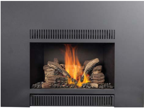
Universal Face - Large