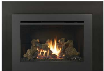
1 Piece Panel - Times Square Face