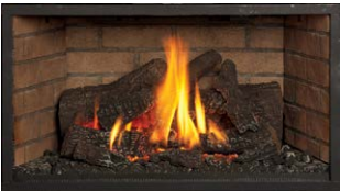
Straight / Herringbone Brick