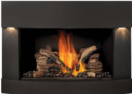
Cypress Face - DVS Only