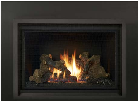
Profile Face Black