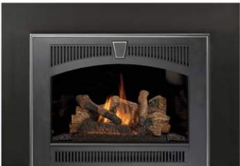
1 Piece Panel - Wilmington Face