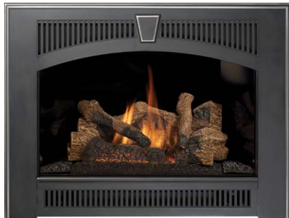
Wilmington Carbon Patina (Also available in black)