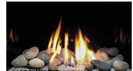
Dancing-Fyre™ Fyre-Stone Rock™