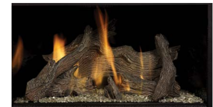
Dancing-Fyre™ Driftwood Fire Art™