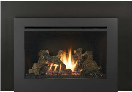
Times Square™ Face