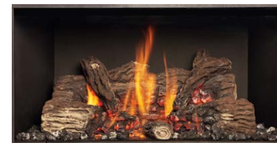
Dancing-Fyre™ Traditional Log