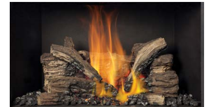
Dancing-Fyre™ Traditional Log