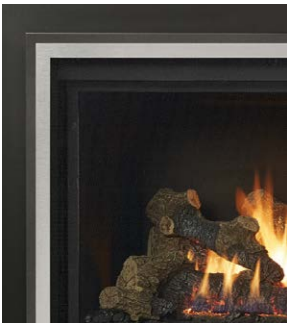
Profile Face Stainless Steel