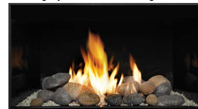
Dancing-Fyre™ Fyre-Stone Rock™