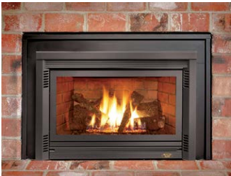
Can be modified to fit inside original fireplace (3 Piece Panel)

Available in 2 sizes for both the DVS GS2 and DVL GS2 and in a Custom 4 sided format providing coverage of 100mm below the firebox for slightly elevated or raised installations.