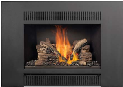
Universal Face - Small