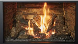
Ledgestone (DVL Only)