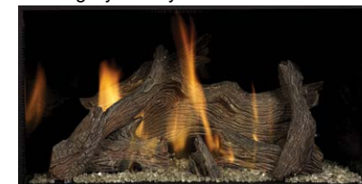
Dancing-Fyre™ Driftwood Fire Art™