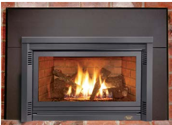
Available in 3 Sizes, Can be cut down to suit opening (3 Piece Panel)