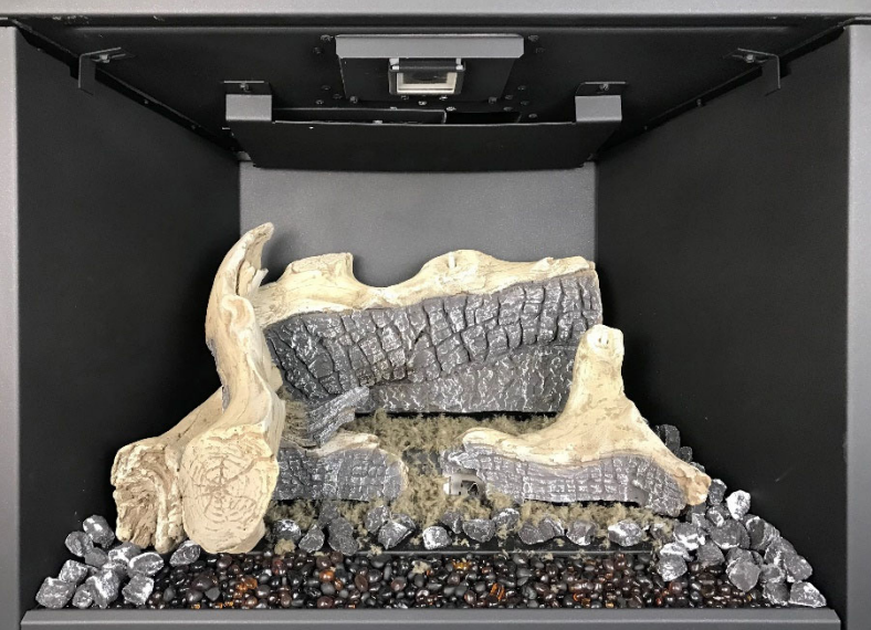
NOTE: Remove all rockwool from the pilot area (see below).